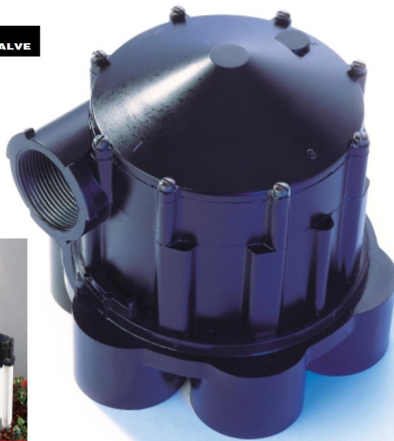
6000 SERIES DISTRIBUTING VALVE

Distributing or indexing valves are used to dose up to 6 outlet pipes with a single pump. They are ideal for wastewater pressure systems which require dosing of multiple sections or zones. This reduces the size of pump required thereby saving pump and energy costs. Valves are essential when pumping to a large pipe network or to pump to a number of pockets of area on a small site or landscaped commercial areas.